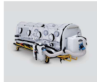
IsoArk N 36-7