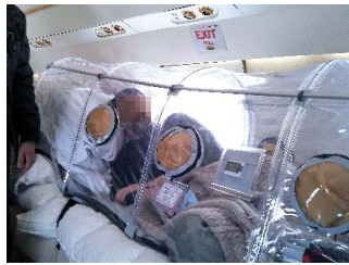
IsoArk N 36 series single person transport chamber