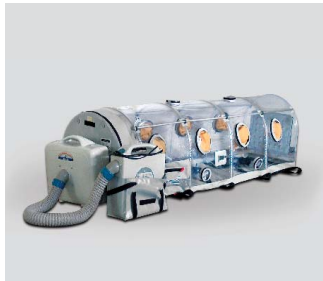
IsoArk N 36-4

Safe Transport of Infected / Depressed Immunity Patients