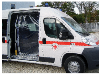
Biological Isolation Ambulance