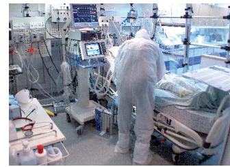
Roomy interior of the IsoArk isolation chamber