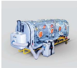
IsoArk N 36-6