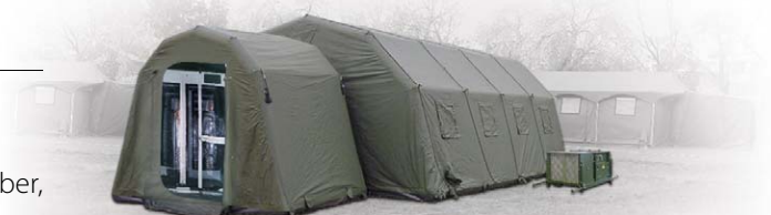
IsoArk 'Anak' Large Scale Isolation Chamber